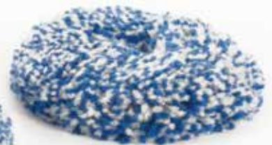
9.BL180H for Ø125mm / Ø5" backing pads