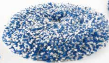
9.BL200H for Ø150mm / Ø 6" backing pads